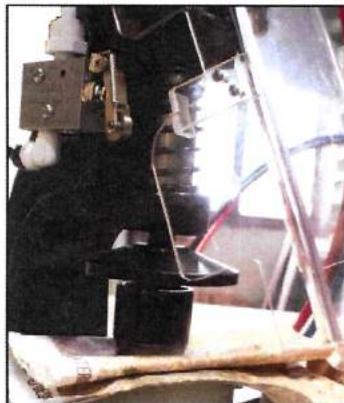
5.- Place material on the nylon block. Lay cutter on material. Step on foot pedal to cut button covers. Fold material for multiple cuts.