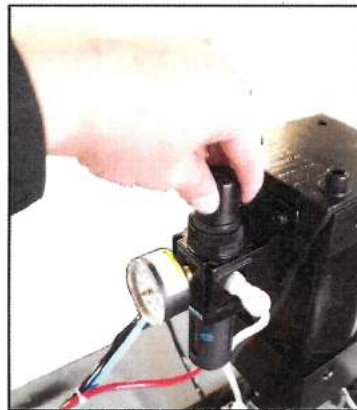
3.- Adjust air knob to desired pressure.