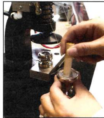
7.- Holding the die use the wood dowel to push in the shell.