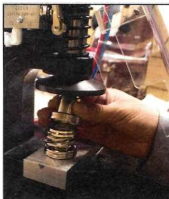
9.- Place the two piece die together as shown. Lock in bottom die with Allen wrench key provided. (If needed).