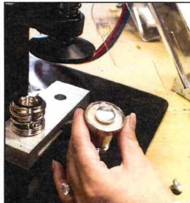
6.- Turn shell die. Place the cut material, then center the shell on top as shown.