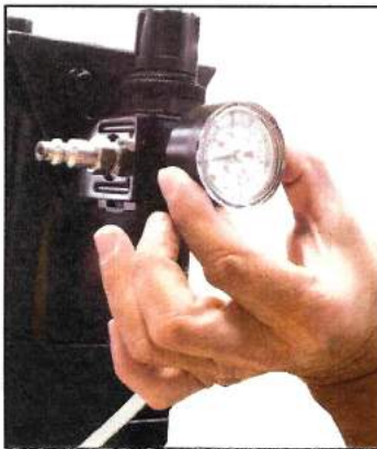
1.- Screw air gauge to the machine.