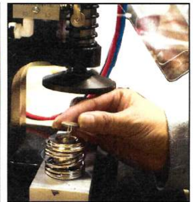
8.- Set the other die on the machine, lay the wire eye with the loop facing down.