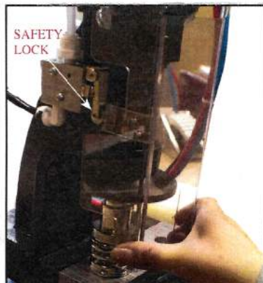
10- Push in and lock safety clear shield to operate the machine.