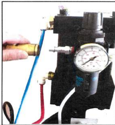
2.- Connect air hose.