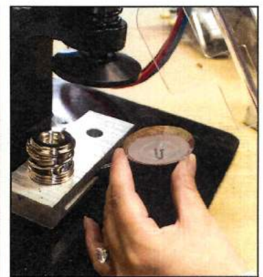
4.- Remove top die and release covered button.